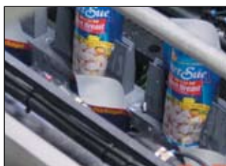
PSG ABT 6 Lane Transverse machine, filling and sealing Premade StandUp Retort/shelf stable Chicken pouches.