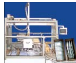
Blueprint Automation Case Packer

Blueprint Automation is a world leader in packaging automation, providing solutions for the loading of flexible pouches and other hard-to-handle packages into secondary containers.