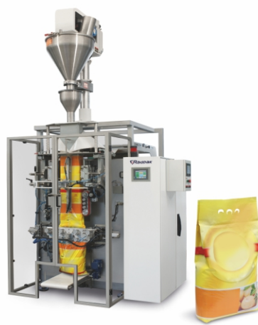
VFF&S Machine RM-45AC with servo auger doser.