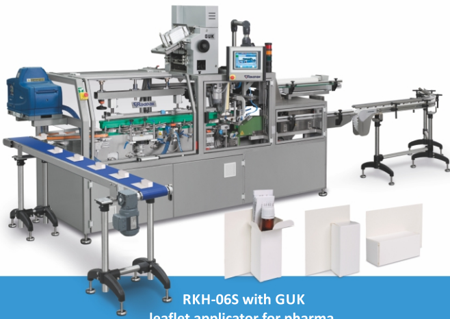
RKH-06S with GUK leaflet applicator for pharma.