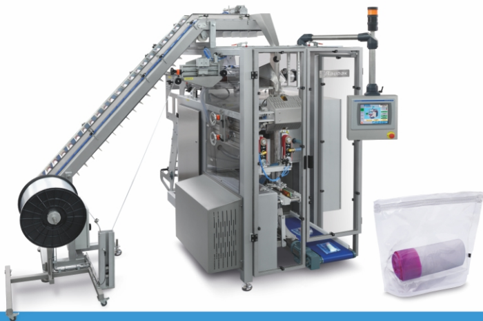
VFF&S RM-25ACD Doypack with Press-to-Close Zipper applicator.