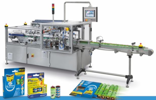
Horizontal cartoner. RKH-06S continual motion designed to pack fly ribbon.