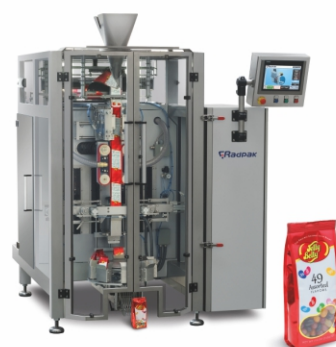
VFF&S Machine RM-25ACC Quad pouches/bags Continuous Motion.