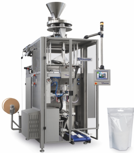
VFF&S Machine RM-45ACD Doypack with Press-to-Close Zipper.