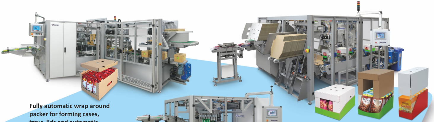
Fully automatic wrap around packer for forming cases, trays, lids and automatic grouping - loading products.

Wide range of single products packed into Retail Ready Displays.