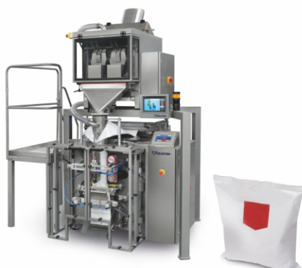
VFF&S low profile Machine RM-25AC.