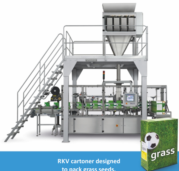
RKV cartoner designed to pack grass seeds.