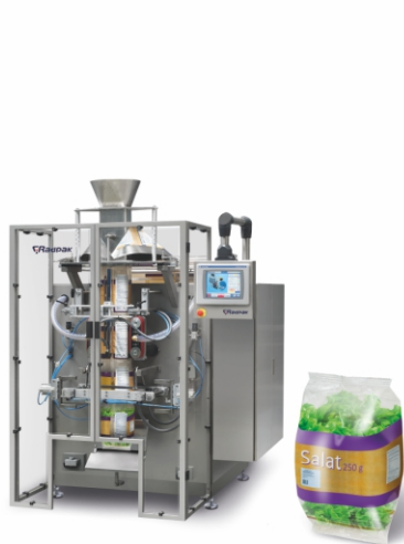
VFF&S Machine RM-32AI made of stainless steel.