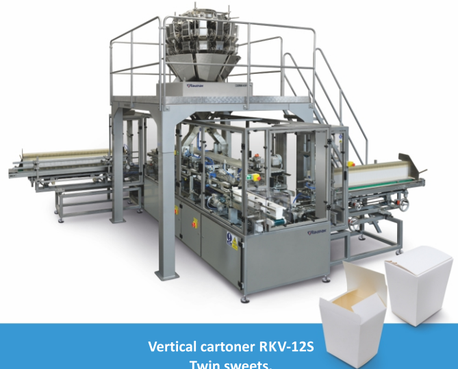
Vertical cartoner RKV-12S Twin sweets.