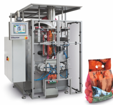
VFF&S Machine RM-32ACF Carry Fresh for packing vegetables into net bags.