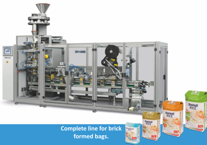
Complete line for brick formed bags.