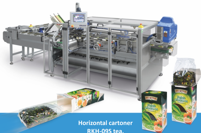
Horizontal cartoner RKH-09S tea.