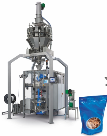
RM-36 ACD StandUp Pouch with Press-to-Close Zipper Machine.

Radpak engineers, manufactures and integrates Complete Packing Lines including End of Line systems.