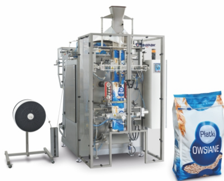
VFF&S Machine RM-36AC Quad pouches/bags with zipper applicator.