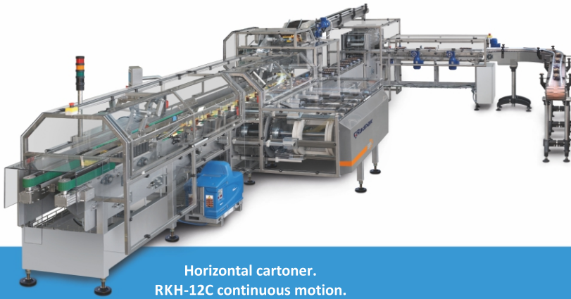
Horizontal cartoner. RKH-12C continuous motion.

Wide range of vertical and horizontal cartoners which work in intermitten and continous motion.