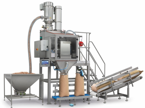
Packaging system for bulk bags, HDPE / PP woven bags, PP / PE pouches or paper bags.