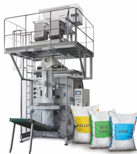
VFF&S Machine RM-55AI for large size bags up to 25 kg.