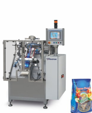
VFF&S Sloped Machine RM-25AC for packaging fragile products.

Machines suitable for packing food and non food products.