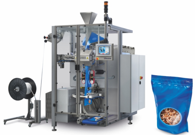
VFF&S Machine RM-36ACD with Press-to-Close Zipper applicator.