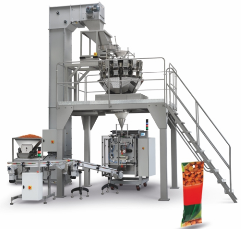
Packaging line for confectionary products.