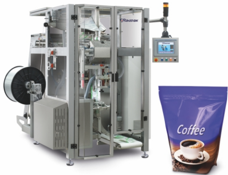
VFF&S Machine RM-32ACD Doypack with zipper applicator.