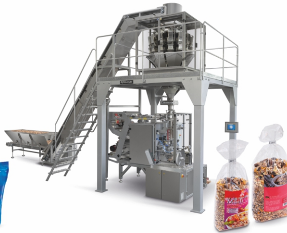
Packaging line for food products Nuts, Candy, etc.