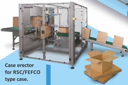
Case erector for RSC/FEFCO type case.