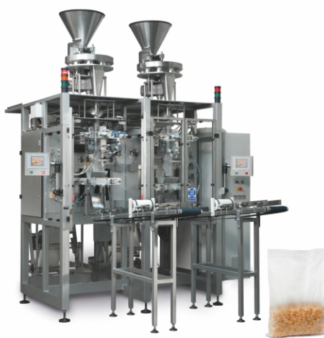
VFF&S RM-25ACC Twin (up to 300 rice sachets / min).